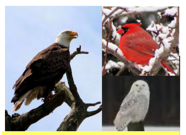
Left to Right: Bald Eagle by R. Lynch; Cardinal by R. Bunting; Snowy Owl by W. Putrycz

throughout the winter. Birds need open water, food and shelter. Put up bird feeders in secure areas AFTER the bears have denned. Provide water if possible. Create piles of brush-branches, limbs and berry bushes- to act as shelter for winter birds. Occasionally Snowy Owls, Redpolls, Evening Grosbeaks. Crossbills and other birds from Canadian boreal forests provide an exciting addition to our common winter flocks. Expect to see ducks and eagles on or near the river throughout the winter months. Eagles need open water to fish and may often be spotted sitting in a dead tree.