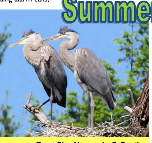
Great Blue Herons, by R. Bunting

It is harder to see through the leafed out trees. Watch for beautiful colors flashing through the air: Goldfinch, Rose-breasted Grosbeak, Baltimore Orioles. Fewer bird songs fill the air in summer. (A, B) Adult birds are busy looking for food and feeding their young. By July you will hear baby birds begging for food from their harried parents. When you hear birds screeching and sounding alarm calls,