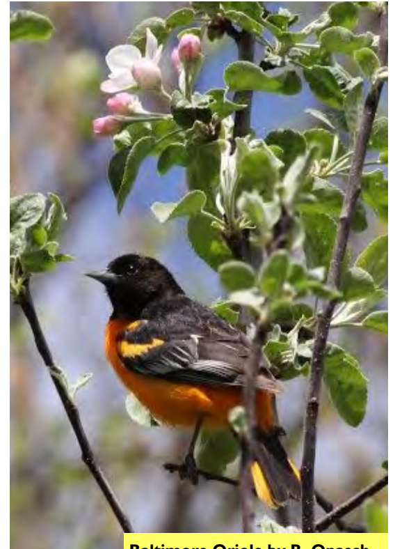
Baltimore Oriole by B. Onasch

This guide to local birds in Delhi, NY and its environs is intended for the novice or expert, the young or old, the native or visitor.