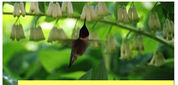
Ruby-Throated Hummingbird

appalachianeagles.org — Golden eagle research project