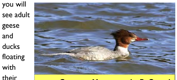
Common Merganser by B. Onasch

The birds who nest here are all around. Summer is about raising and protecting their young. On the river