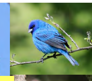
Left to Right: Yellow-Rumped Warbler, Indigo Bunting, Rose Breasted Gros beak, all by B. Onasch